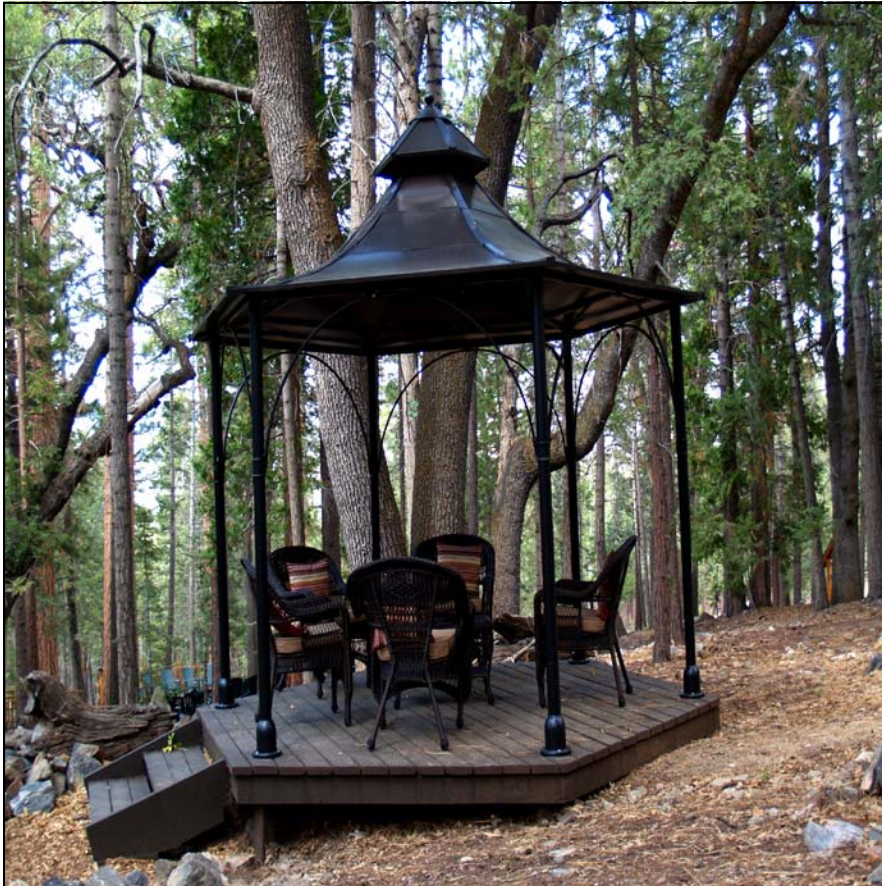
The Gazebo at Camp de Benneville Pines