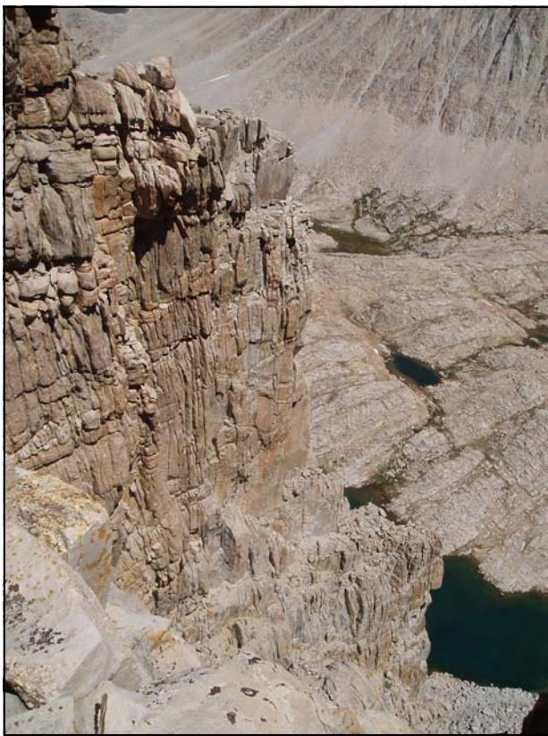
Somewhere in the Sierra Nevadas