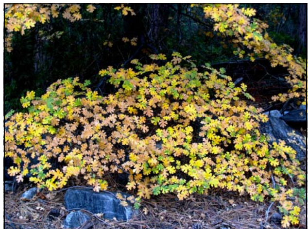
Fall color in the oak leaves at Camp de Benneville Pines

Ellen Germann-Melosh, PSWD Compensation Consultant