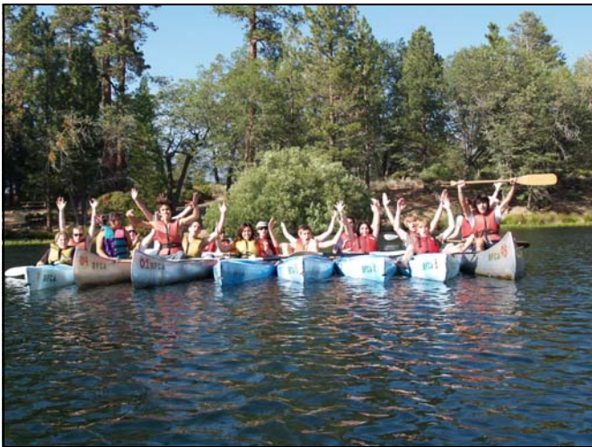
One of the Youth Camps at Camp de Benneville Pines

Your district is home to a solid youth camping ministry program that dozens of volunteers have worked so hard on for many years. We run six camps, three in the summer and three in the winter. For each camp, we have 22-26 volunteer staff of youth, young adults, and adults. These camps are steeped in UU identity, faith development, worship, self-esteem building, and fun.