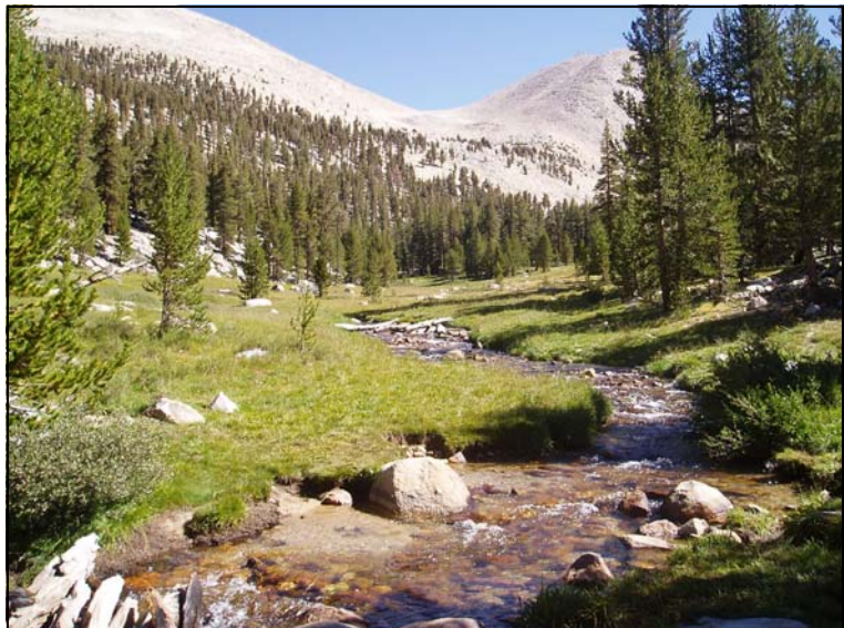
Sierra view: Crabtree Creek